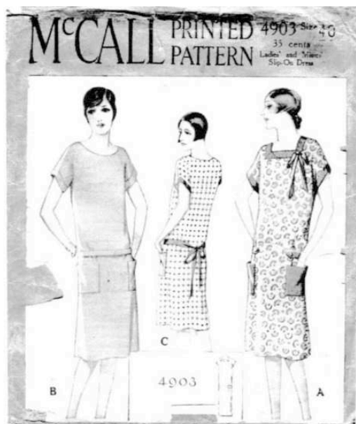
1929 Women's Daytime Dress McCall 4903 Size 40

Housedresses of the period are usually made of cotton and will have some sort of pretty trim or feature, so that the housewife can feel attractive while she carries out her daily chores.