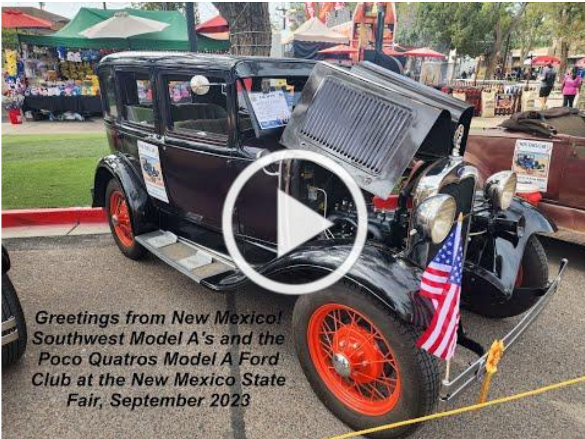
Greetings from New Mexico! Southwest Model A's and the Poco Quatros Model A Ford Club at the New Mexico State Fair, September 2023