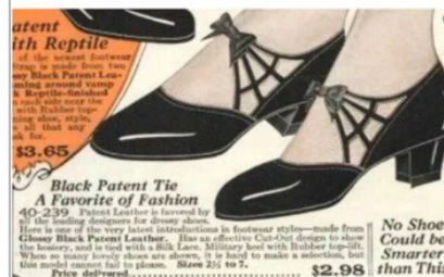
Reproduced Spiderweb shoes from American Duchess