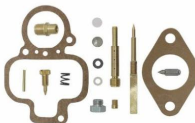
Marvel Shebler Model A or B