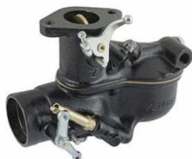
Zenith Model A

When ordering parts or looking up adjustment specs for your carburetor, it is important that you identify which one you have. Below are 4 of the most common carbs used on a Model A with the gasket sets they use, which gives you a feel for the shape of the casting and bowl. Until next time, Have a Model A Day! Jim