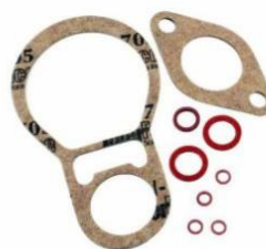
Tillotson Model A